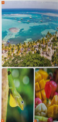
3 Plage de Sainte-Anne 4 Lézards 5 Capotaire

balcon au cœur de l'océan de Terre-de-Bas ; la sérénité réservée face au coucher du soleil sur une plage de sable blanc à Terre-de-Haut! Les côtes de l'archipel sont au-delà des corals, des petites îles. Plus de 420 km de plages permettant des vacances à la carte : pieds en éventail pour les unités, sensations fortes des sports nautiques et de glisse pour les autres. Avec leurs nombreux spots de surf de windsurf et de kitesurf la renommée internationale, les îles de Guadeloupe sont un terrain de jeu pour les amoureux de sports de glisse. Le tout dans une palette de couleurs teintées par des sables se déclinant au blanc, doré ou au noir volcanique. Plage du Souffleur à La Désirade, de l'anse de Mays à Marie-Galante, du Pain de Sucre aux Saintes avec la douceur de l'eau chaude, cristalline et limpide. Et quand on décide de suspendre un peu cette délicieuse fanfane pour sillonner la Guadeloupe, elle surprend sans cesse, même à quelques enjambées. Une traversée de Marie-Galante à vélo en est une emblématique expérience, entre ses cent moulins, ses distilleries et sa riche mangrove. Sillonner les cirques de l'archipel est aussi une autre expérience fascinante. En gyroplane et ULM pour ceux qui préfèrent être bercés ou par un saut en parachute pour ceux qui souhaitent des frissons.